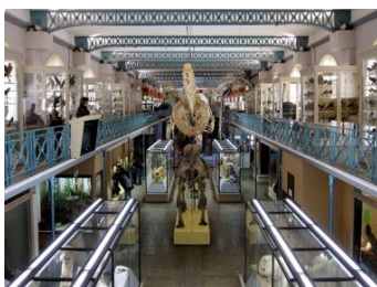
Musée d'Histoire Naturelle

Social activities include the icebreaker party and reception on Monday July 10 th , as well as a visit to the Natural History Museum Lille , and a conference dinner that will be organized on Wednesday, July 12 th , at the Hermitage Gantois, an ancient hospice of the late 15 th Century.