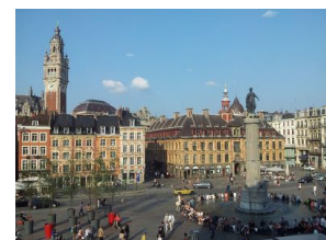
Lille 'Place Général de Gaulle'

90 minutes from London 60 minutes from Paris 45 minutes from Brussels