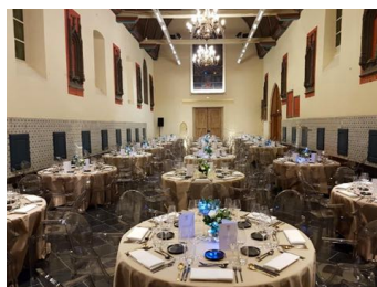
Salle des Hospices