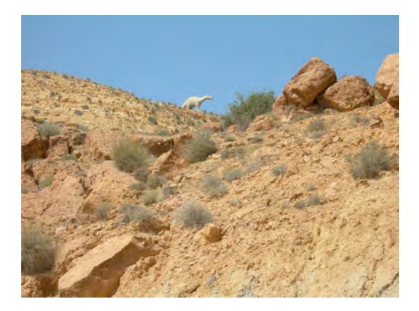
Fig. 3. Upper Jurassic to Lower Cretaceous, with M'Rabtine Formation at Col of Bir Miteur, southern Tunisia, with apparently friendly dinosaur looking on.

Field trip 1 Southern Tunisia. This excursion, led by Khaled EL ASMI and Mohamed SOUSSI and centred in Tatouine,