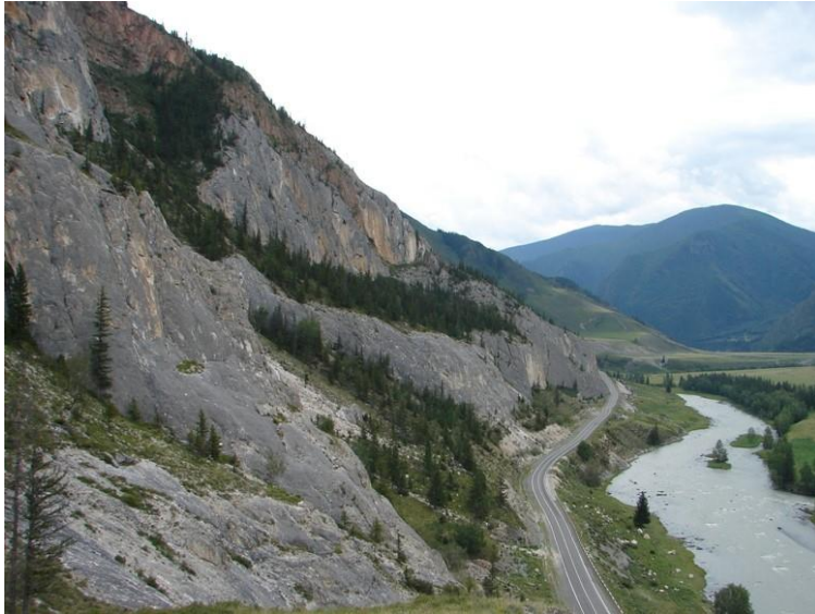
Fig.4. Upper Ordovician reef limestones, Gorny Altai.

slopes and in active quarries. Participants of the excursion will have an opportunity to examine all the Ordovician succession of the Gorny Altai Mountains represented in different shallow to deep-water facies including: 1) delta front; 2) inner shelf (ramp); 3) inner slope of the carbonate platform; 4) central part and outer slope of the carbonate platform; 5) deep-water shelf; 6) continental slope; 7) open ocean deposits and sea mounts. Fossils are represented by graptolites, conodonts, chitinozoans, radiolarians, trilobites, ostracods, brachiopods, gastropods, crinoids, scolecodonts, tabulate and rugose corals, bryozoans and algae.