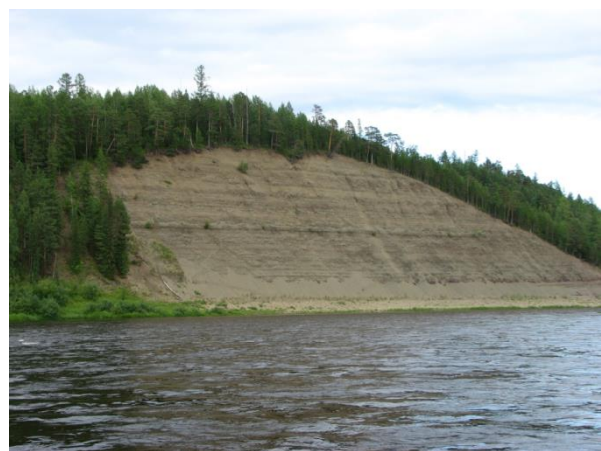
Fig.5 (left). Field camp. Tributary of Podkamennaya Tunguska River