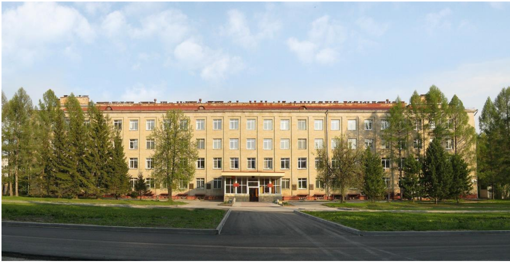
Fig.1. Main building of the Trofimuk Institute of Petroleum Geology and Geophysics, Siberian Branch of Russian Academy of Sciences

Geology and Geophysics (Fig. 1) and the conference room of Novosibirsk State University as required. Hotel, conference halls, cafes, restaurants, shore of the Ob' sea are all within a walking distance from any point of the Akademgorodok.