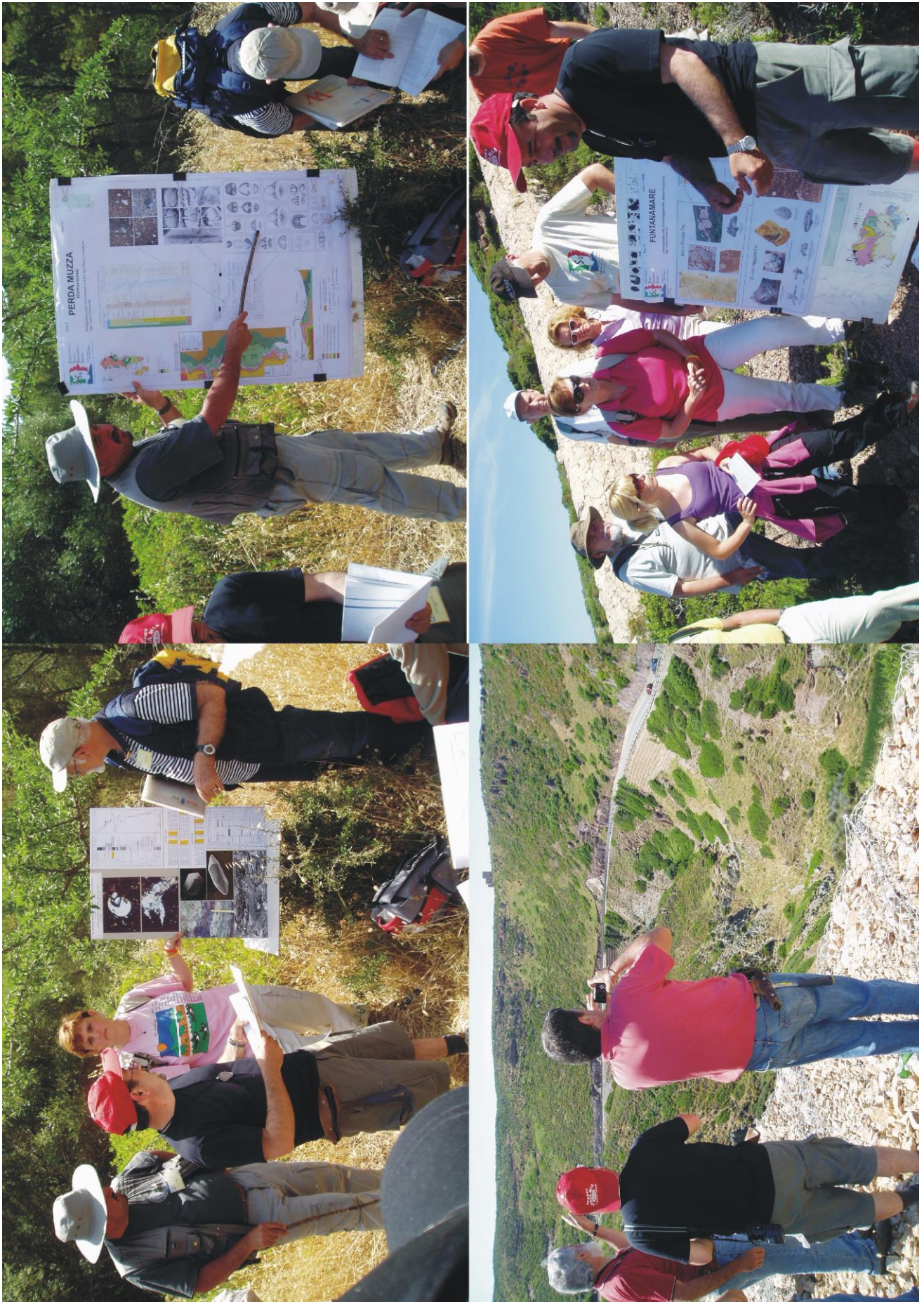
6.2. Paleozoic Seas Symposium (14-18 th September 2009, Graz, Austria)