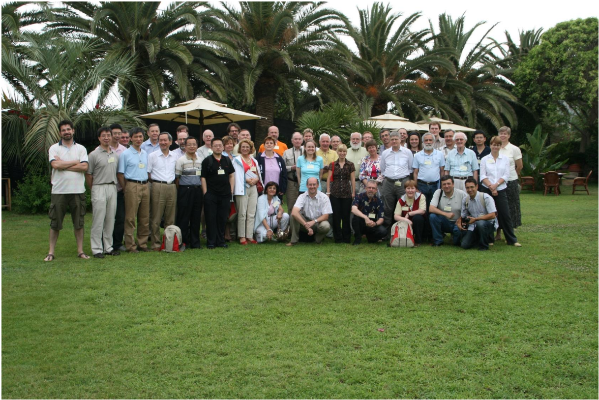
Group photo at the conference in Villasimius Sardinia.