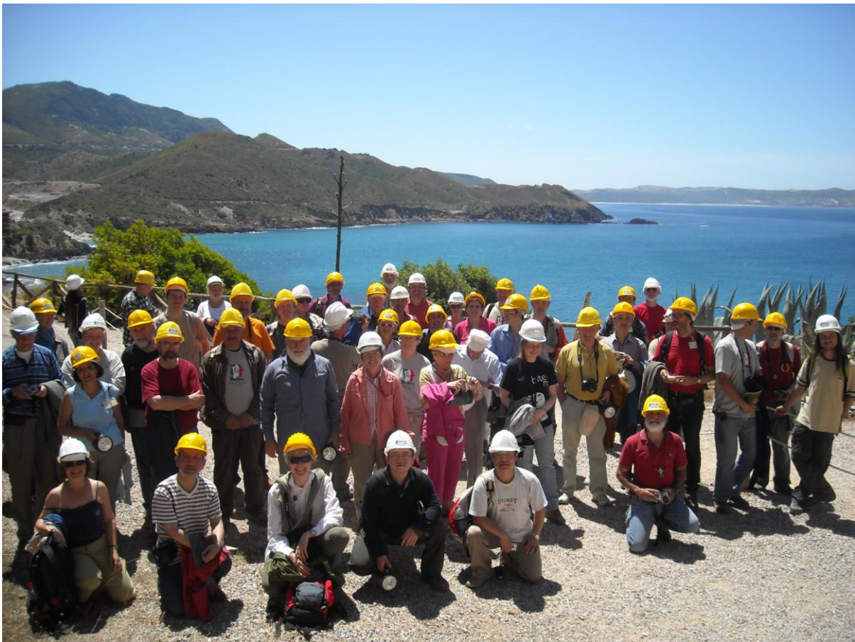
Group photo during the excursion when visiting the old port of Porto Flavia, a mineral charging installation, excavated in the mountain with access to boats in the sea.